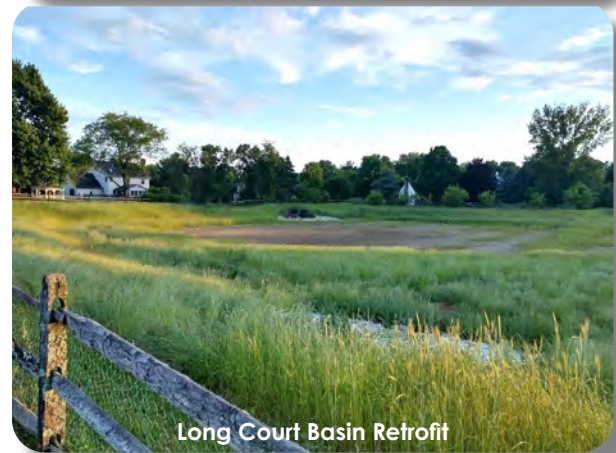
Long Court Basin Retrofit

To learn more about these projects and other stormwater projects identified in the Bethlehem Township 5-year stormwater capital improvement plan, visit the Township's stormwater projects page on our website: