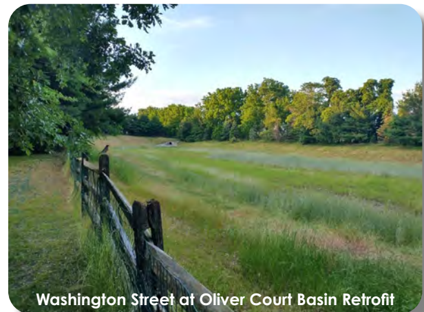
Washington Street at Oliver Court Basin Retrofit